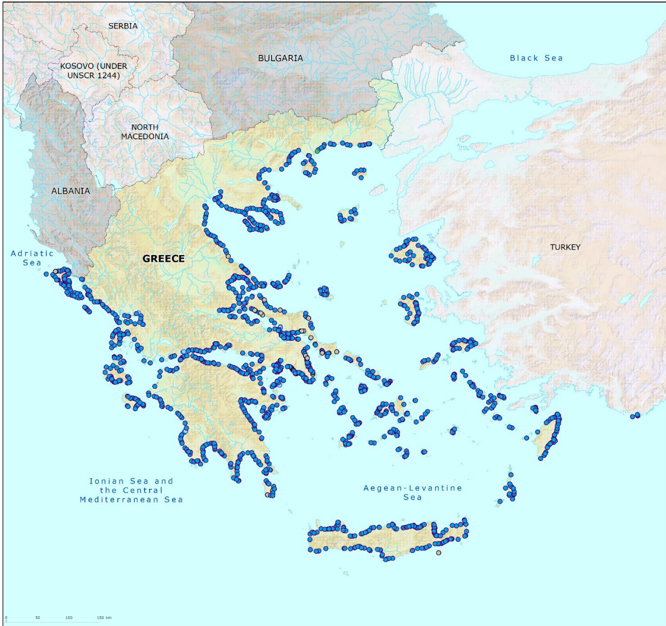
Map 1: Bathing waters reported during the 2024 bathing season in Greece